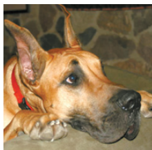
Cover photo of Thunder courtesy of Eileen.